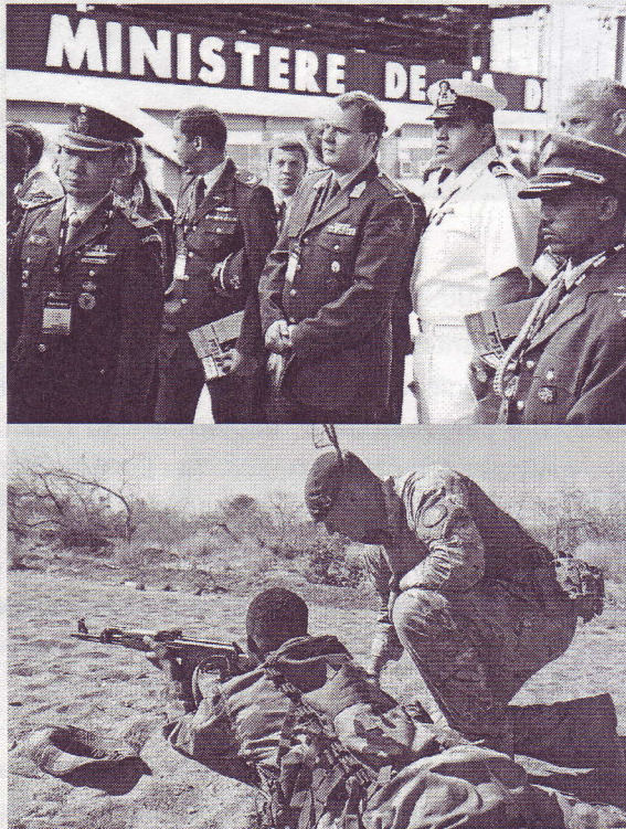
Top: Eurosatory arms fair in Paris.